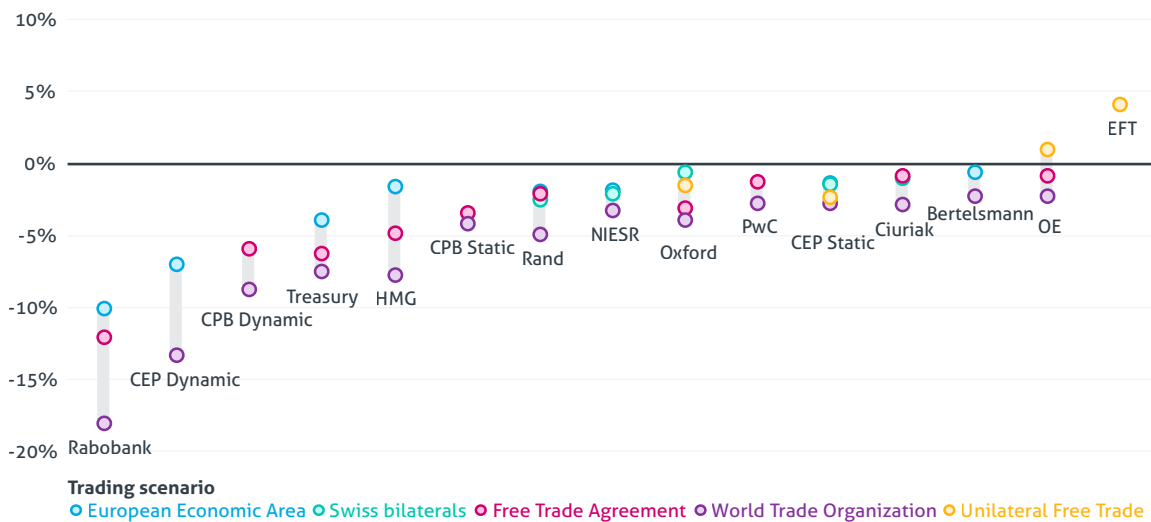
Figure 1: Forecast long-term impact of Brexit on GDP, relative to remaining in the EU