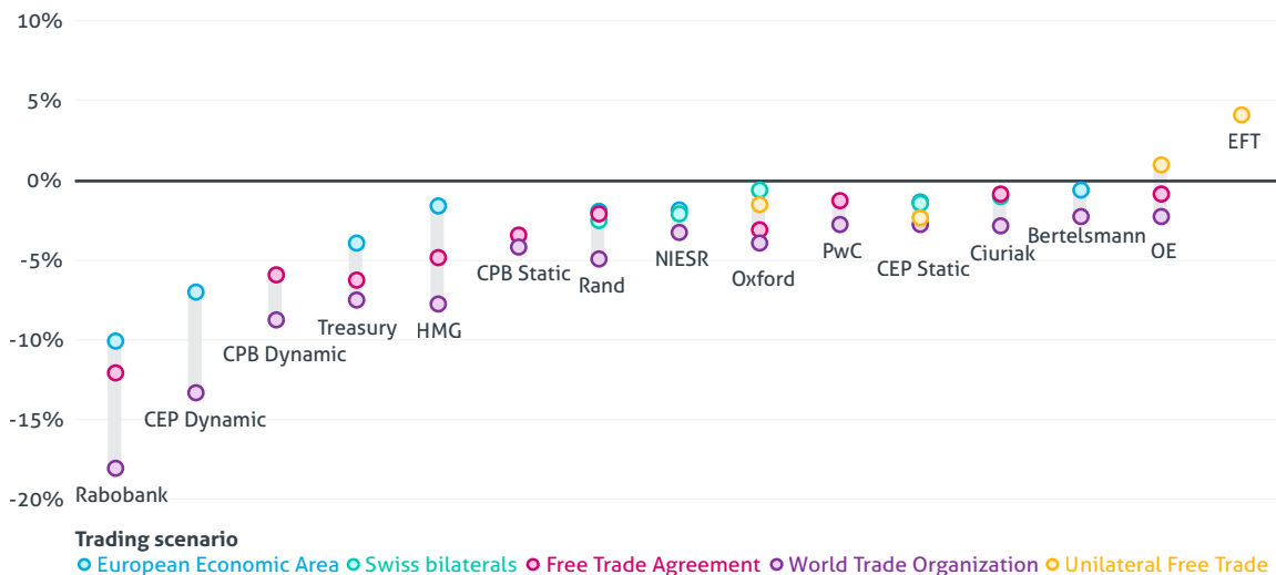
Figure 2: Forecast long-term impact of Brexit on GDP, relative to remaining in the EU